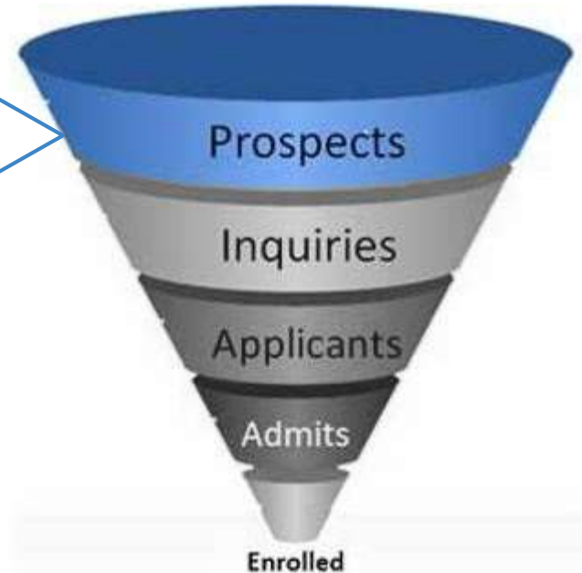
The Traditional Enrollment Funnel