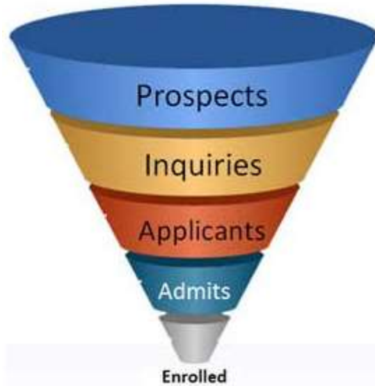
The Traditional Enrollment Funnel